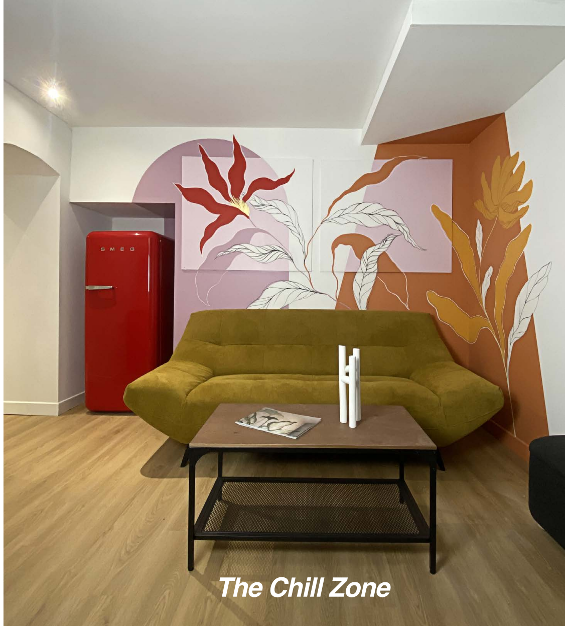
The Chill Zone